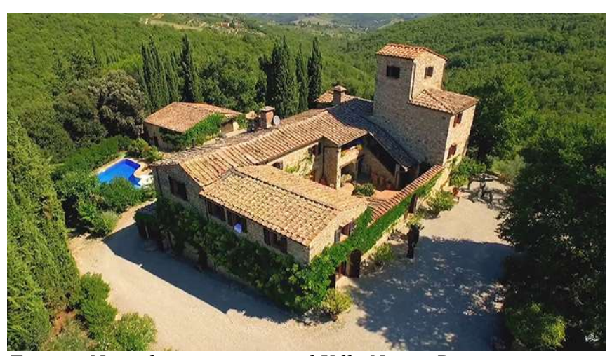
Fattoria Nittardi was once named Villa Nectar Dei.