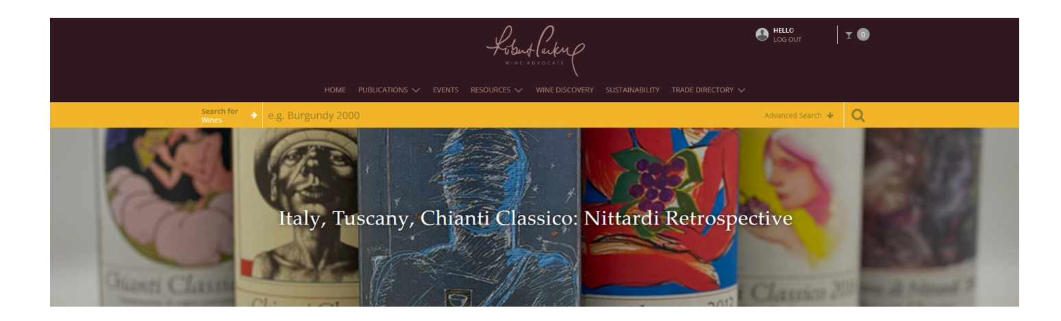
Italy, Tuscany, Chianti Classico: Nittardi Retrospective